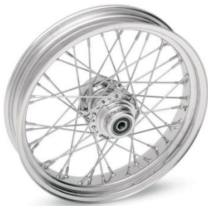
Motor Cycle Parts