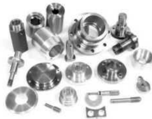
Small M/C parts