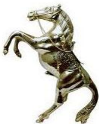
Antique Show Piece